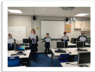
Hour of Code during Computer Science! Year 7s gaining their certificate.

Since the start of term we have seen our students really engage with their learning again after so long away because of the national lockdown. Here is a flavour of what they have been up to both in school and when they have been learning remotely at home: