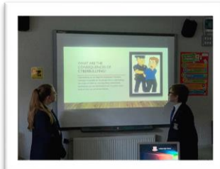
Year 7s presenting their Cyberbullying Presentations

Year 11 Computer Science Lesson, defragmenting with skittles!